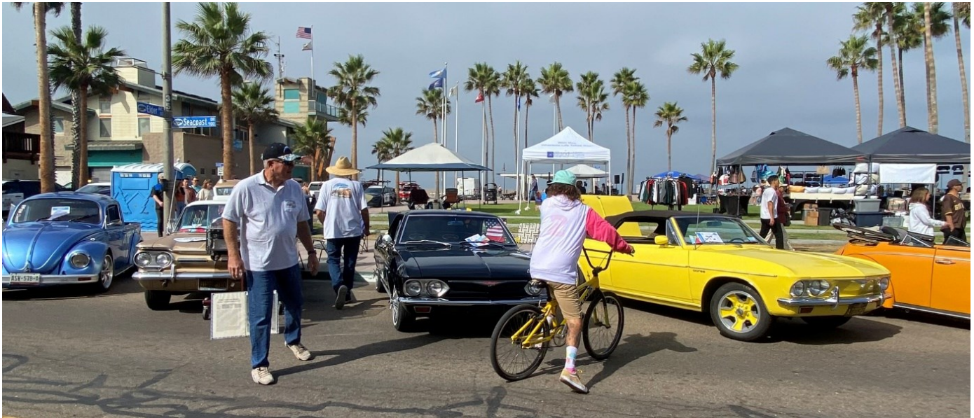
Air Cooled Fiesta, Imperial Beach